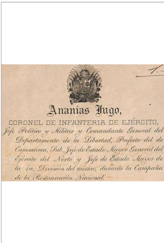
Image: Detail of printed part.