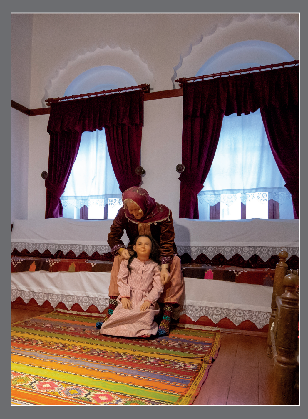
Handicrafts, fabric printing, clothing and accessories, kitchen tools and equipment, lighting, measuring instruments, firearms and cutting weapons and seals belonging to the Malatya region are exhibited.

Beşkonaklar, where a two-story mansion with a pinnacle (Cihannüma), a pavilion, and a balcony, and four mansions with similar architecture adjacent to it, which the leading families of Malatya reside and built by Hacı Sait Efendi (Turfanda) and his brothers 120 years ago, are among the original examples of the traditional civil architecture of Malatya. The mansions consist of two floors namely, the ground floor and the upper floor. Through the winged door, one enters the hall, which is called Hayat/taşlık, which is usually used in summer. The spaces on both sides of the hall are used as kitchen-fireplace, pantry and room, followed by the courtyard. There is a sofa in the middle and rooms around it in the upstairs.