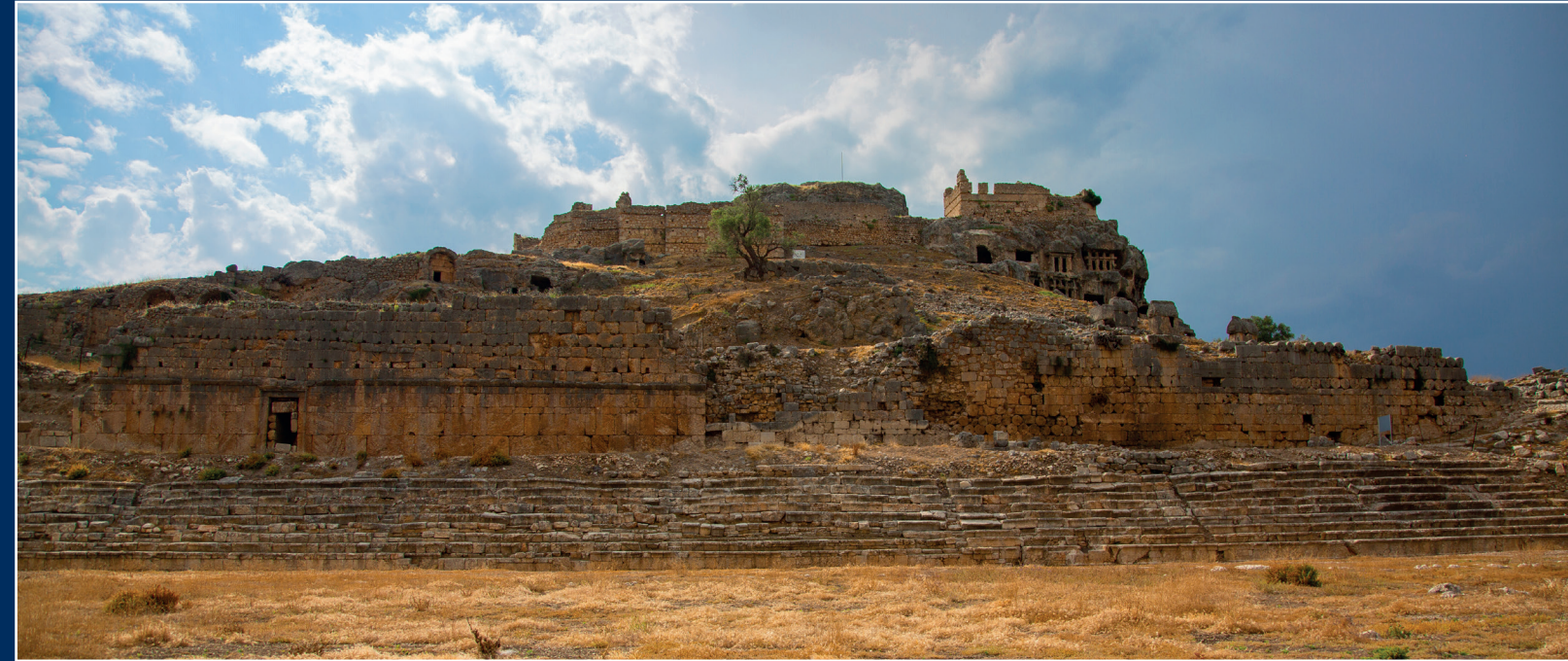
Bellerophon and Myth of Pegasus

According to Greek myths, the name of the city comes from Tloos, one of the four sons of Tremilus and Praksidke. The city name of Tlos is derived from Tlawa, a Lycian expression. Tlawa, on the other hand, refers to the "Dawala Land" often mentioned in the Hittite texts. The Hittites settlement in Tlos, which is emphasized in the written documents, has also been proved today with archaeological finds. However, both the archaeological data and the findings in the Tlos territory show that the history of the first people in this region dates back to the periods even before the Hittites.