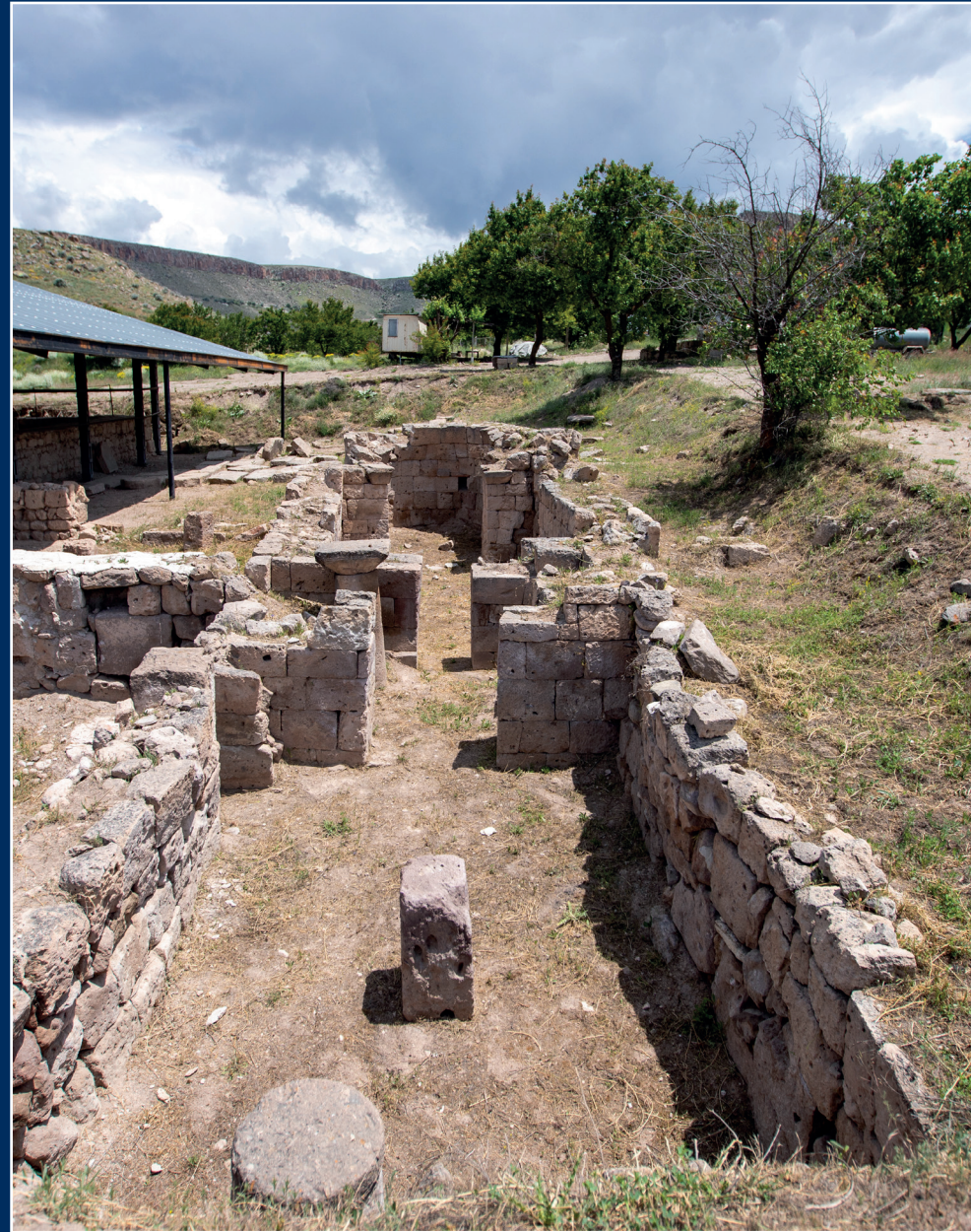
In the ancient city of Sobeos of Cappadocia, covering the Late Roman-Early Christian periods, the chapels, where 1400 years of Christian religious beliefs and teachings are applied, awaits for visitors.