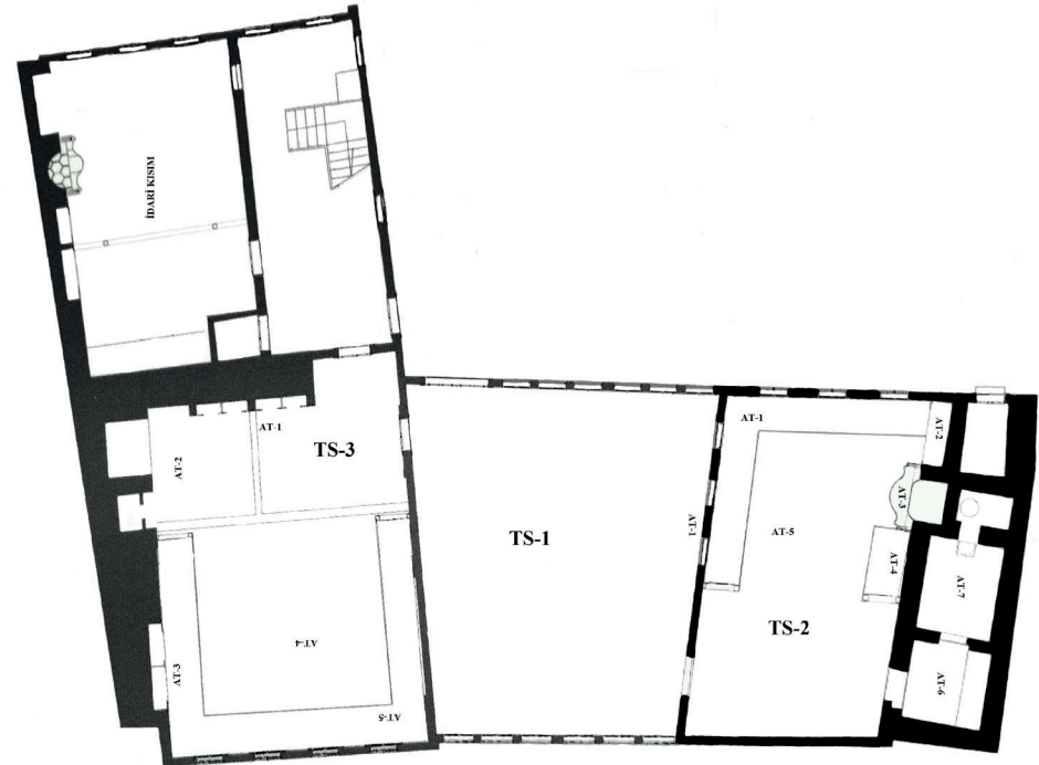
Tokat Latifoğlu Mansion House Museum Ground Floor Plan